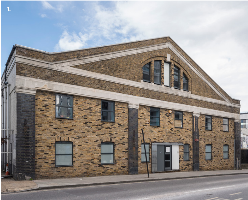
1. Exterior 2. Unit 1.B